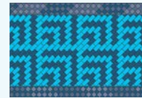
Te Kete Āheitanga Ahurea Māori Kete of Cultural Capability Pathways