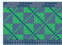
Te Kete Hāpai Akoako Kete of Professional Learning and Development